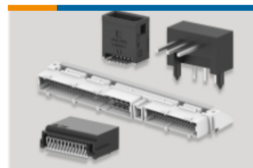
PCB Headers & Receptacles(763)