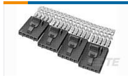
TE Part # 103960-8 2X9 MTE RCPT SR LATCH .100CL