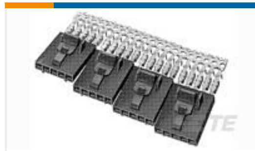
TE Part # 103957-8 2X9 MTE RCPT SR LATCH .100CL